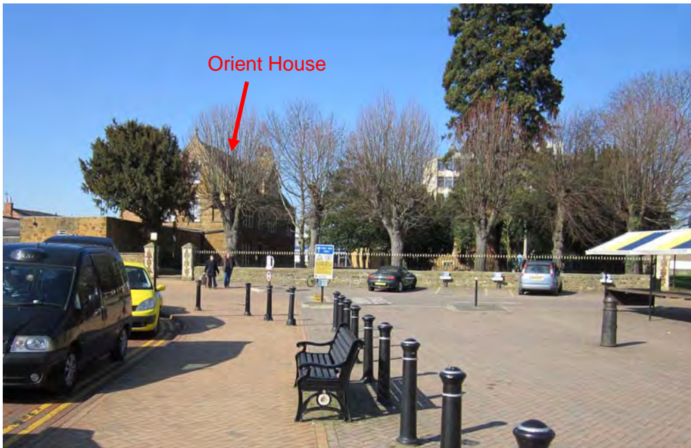
Southern approach from Swansgate Car Park