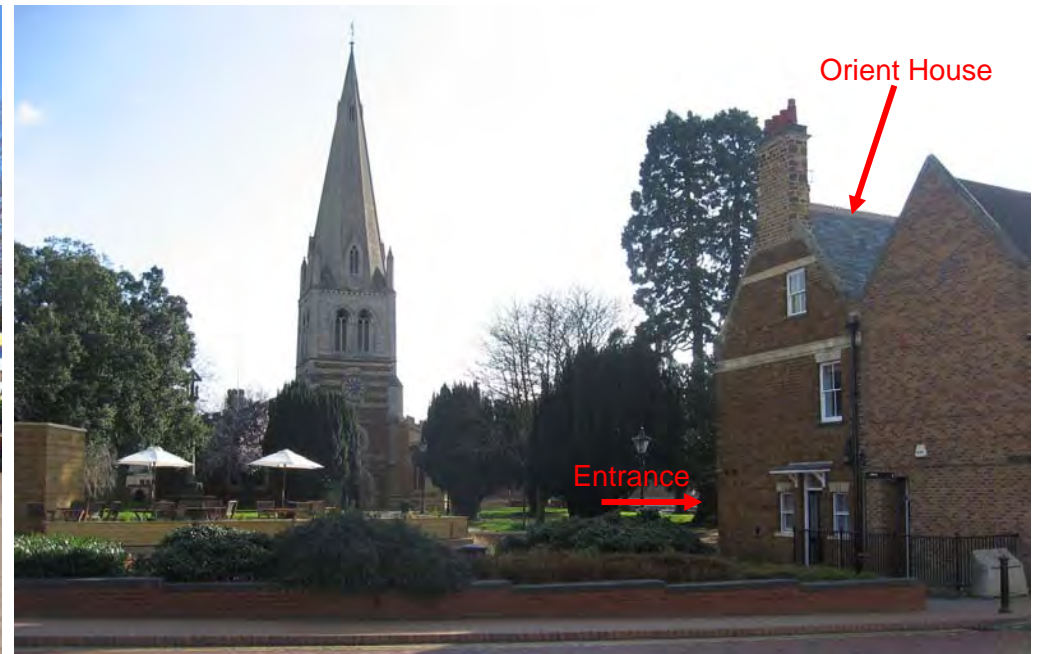
North Western approach from Jackson Lane Car Park